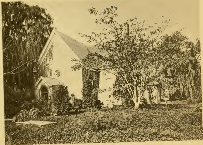
ST. JOHN'S EPISCOPAL CHURCH, HAMPTON, VA., NEAR OLD POINT. ERECTED 1623.